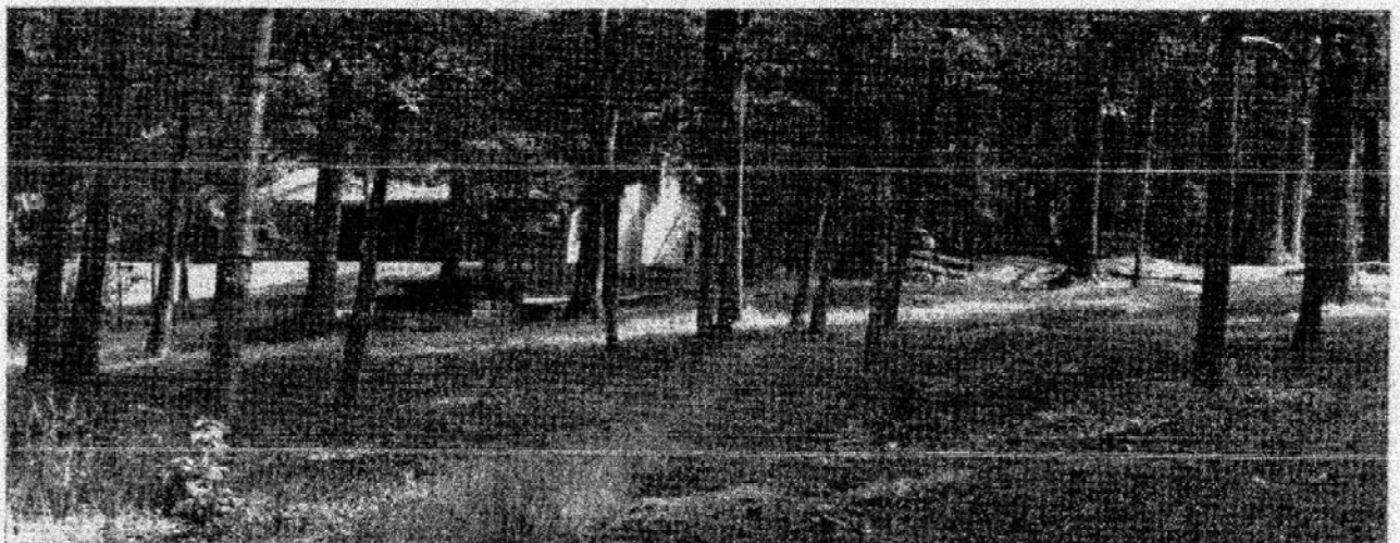
Shelter house and cooking facilities nestling on a wooded slope.

Improvements added in 1958 have made the forest even more attractive to campers and hikers. Three shelters have been reconditioned for overnite sleeping, additional sanitary facilities have been added, and two new camping and picnic areas have been provided.